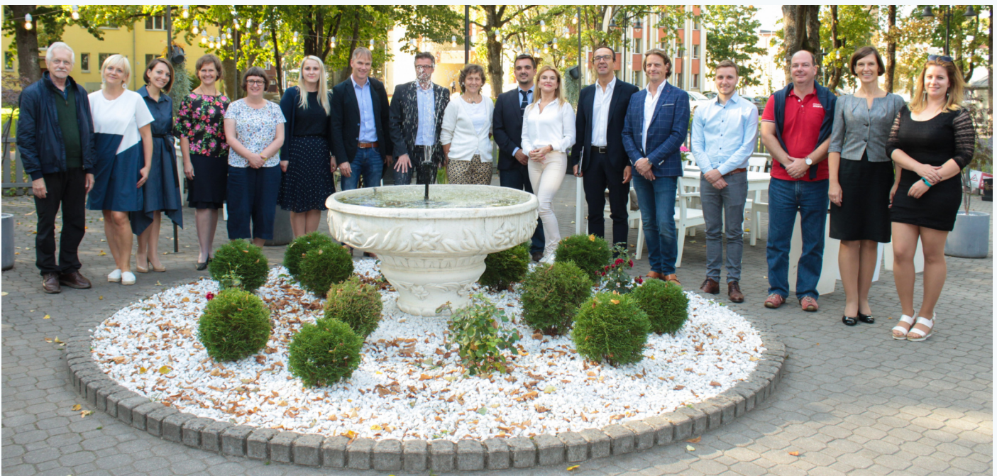
The core team of SWARE in Vidzeme Planning Region, Latvia.