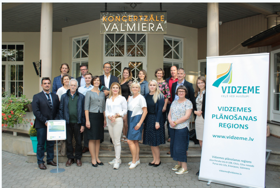
SWARE Team in Valmiera, welcomed by Vidzeme Planning Region.

Introduction to the city's cultural heritage and history, as well as the use of the „main street” – River Gauja.