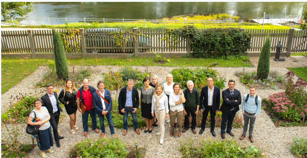
Photo: the core team of SWARE project