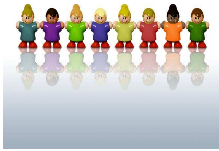
Surprise! The sector really exists as a sector!