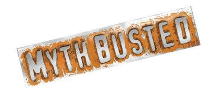
For the sake of art? Not really!