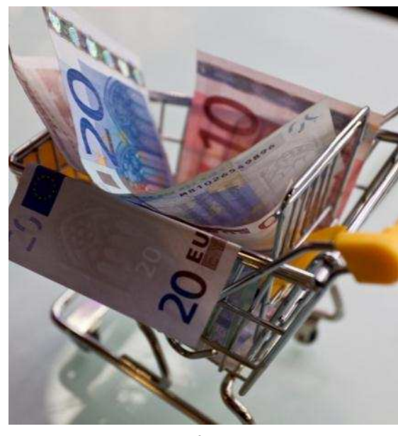
Business development and financing are greater challenges than the rest of the economy